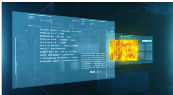
Just one second: What happens when we pay?